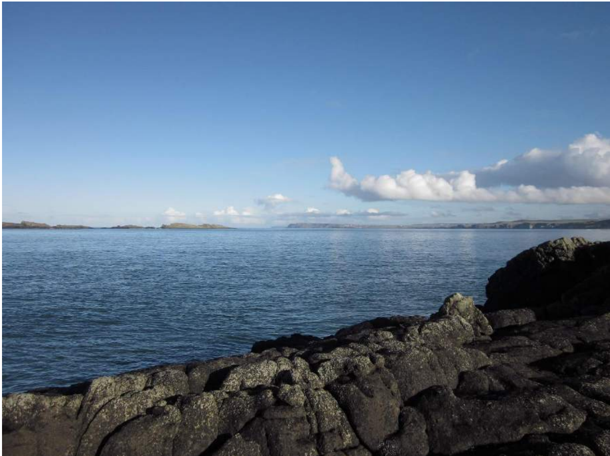
East of Ramore Head, Portrush, looking towards the Skerries and the Causeway Headlands.