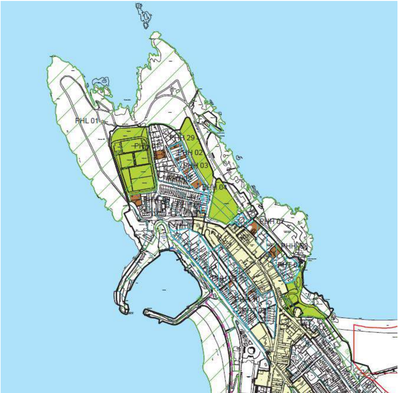
Ramore Head LLPA is shown as PHL 01 indicated by the diagonal green lines. The thick black line represents the development limits for Portrush. (Source: Northern Area Plan 2016). The Northern Area Plan has accompanying text for each of the Borough's LLPAs.