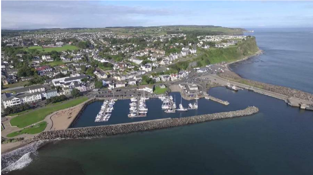
Ballycastle harbour and marina is a focus for tourism with boat trips to Rathlin and Scotland. The development limits for the settlement meet the coastline in the built up harbour walls.