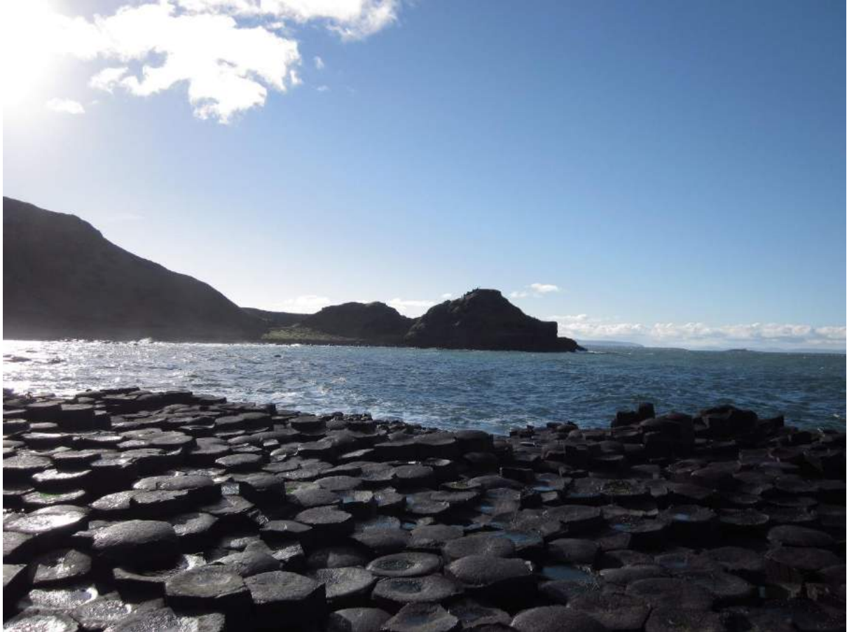
The Giant's Causeway