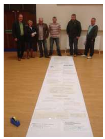
Editing with sticky tape and scissors on the floor in Dervock Community Hall

We have not met everyone in Dervock Ward and this vision is not therefore fully representative. We will have missed local talents. We need to talk to the schoolchildren. If it is to be effective in encouraging and developing the Ward, it will need to have a period of full public consultation, with discussions and experiences shared more widely among local people to confirm their vision. The document can readily be edited and developed.