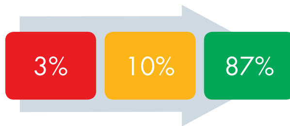
Figure 7: Rating of Organisations' NFI Approach

2.12 The three organisations classed as red are all local councils. Significant organisational change occurred within the local government sector during this NFI exercise and these three organisations gave the NFI a low priority. One of the three councils completed its review of recommended matches by 31 st March 2016, following regular reminders. The two remaining councils had not reviewed all their recommended matches by that date.