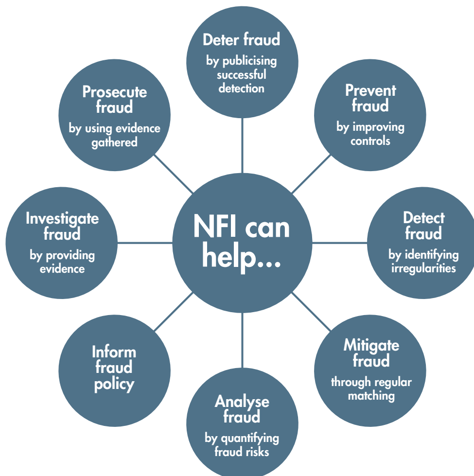
Figure 6: The NFI as part of a counter fraud strategy