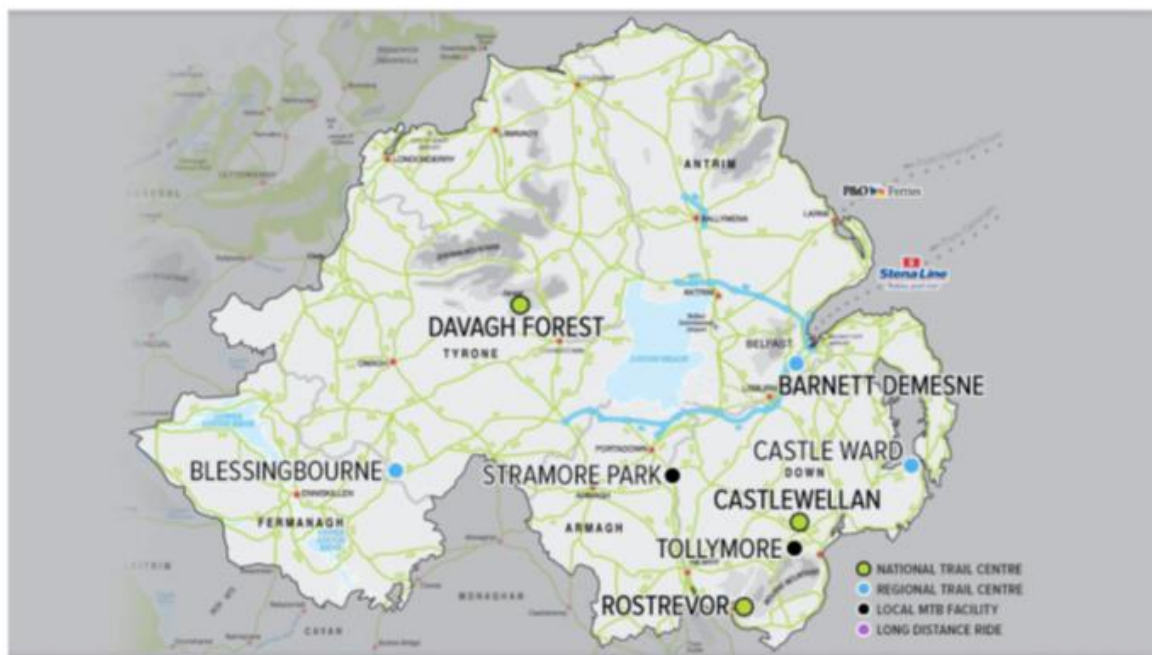
Fig. 1: Location of Mountain Bike Trail Centres across Northern Ireland

Since 2011, 6 purpose built mountain bike trail centres and 2 local mountain bike facilities have opened across Northern Ireland; the location of each is shown in Fig.1 below.