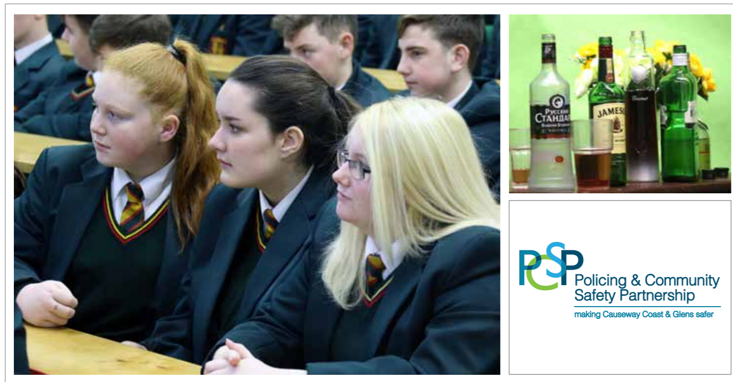
Pupils watching the Last Orders performance