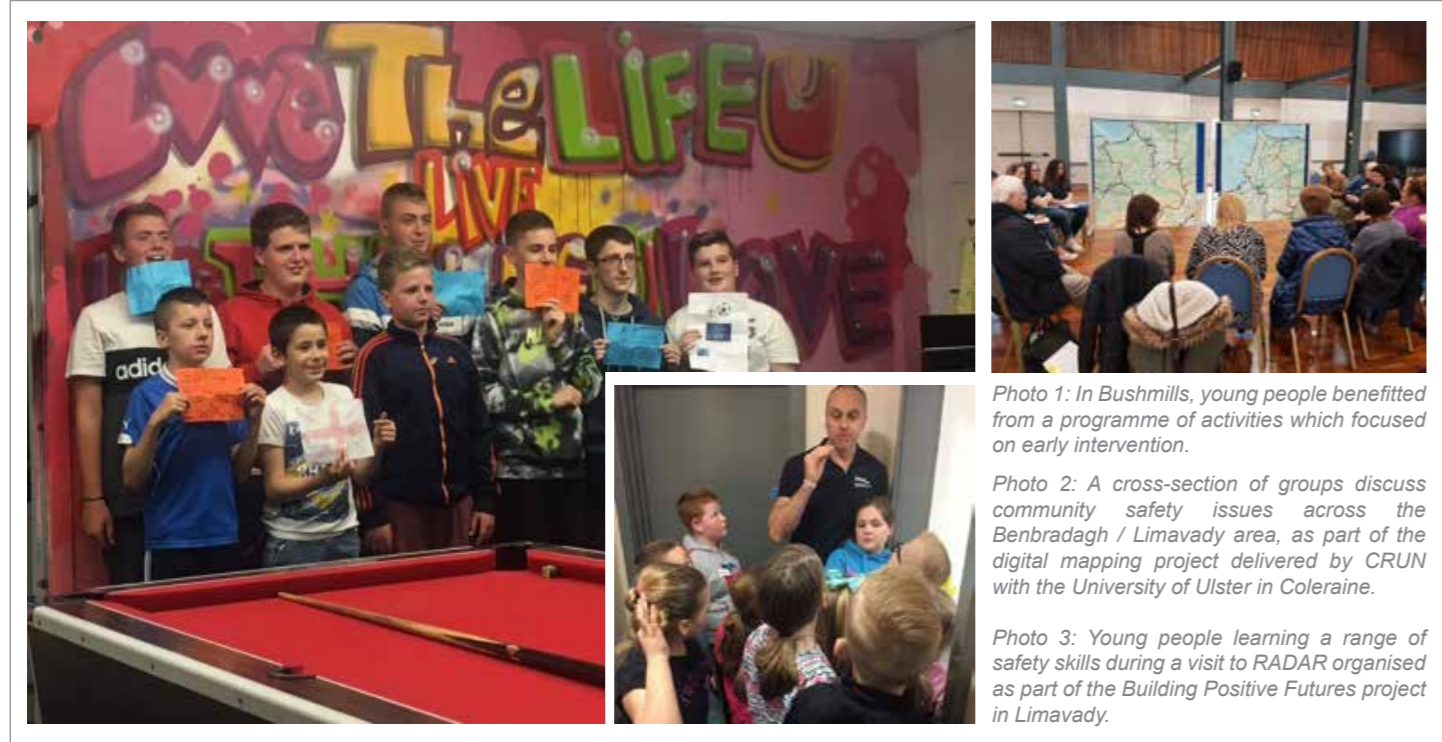
Photo 1: In Bushmills, young people benefitted from a programme of activities which focused on early intervention.