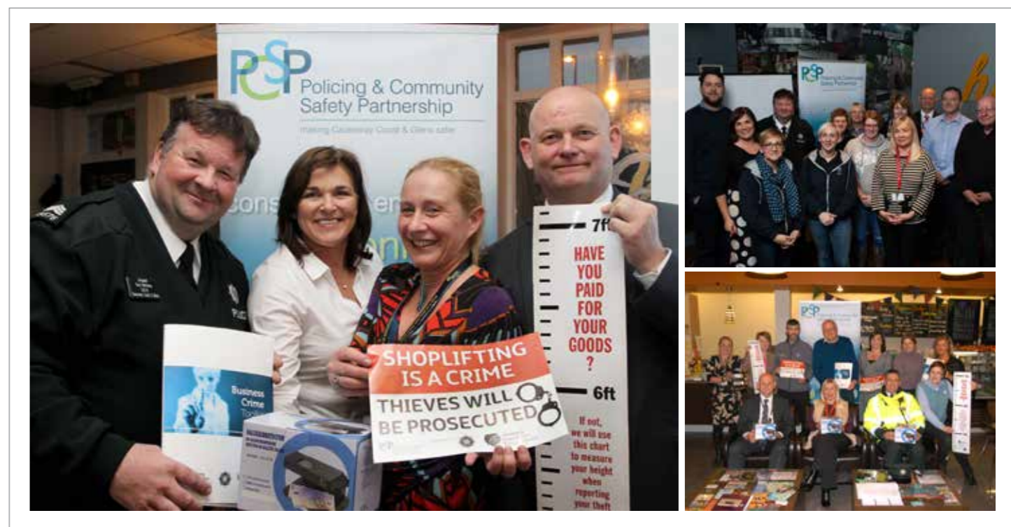
Business crime events across the borough