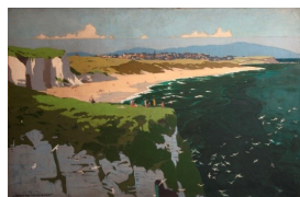
Whiterocks by Norman Wilkinson

Council will demonstrate its appreciation and support for the Armed Forces community who have served and are currently serving in Northern Ireland and abroad. The Armed Forces Day flag will be raised on Coleraine Town Hall and a wreath will be laid to remember those who served and died.