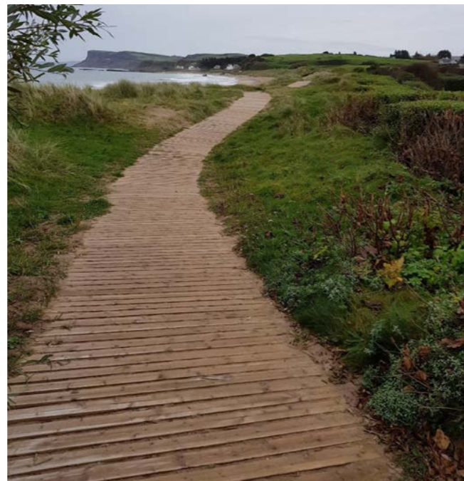
New boardwalk at Ballycastle Beach.