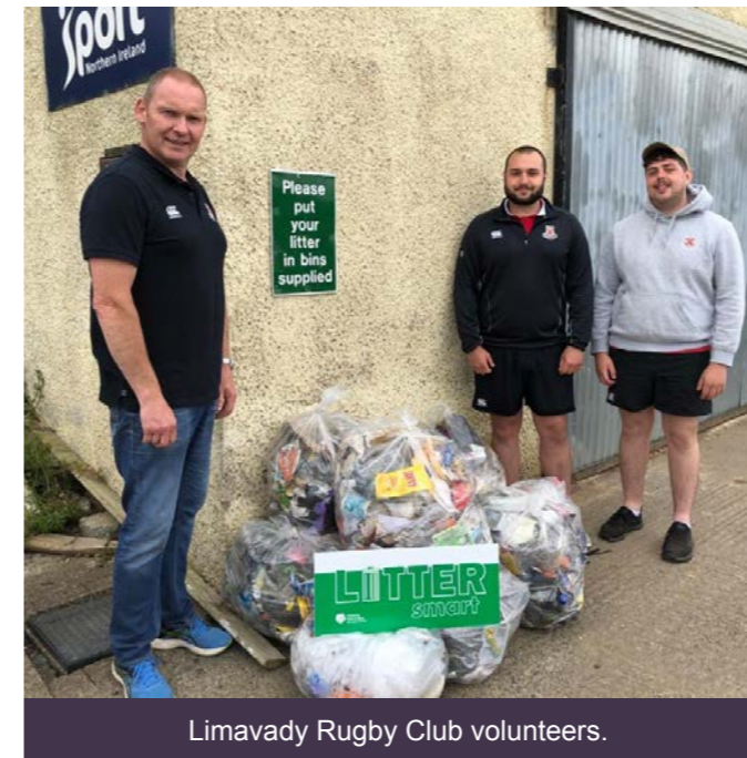
Limavady Rugby Club volunteers.

Let's keep up the good work and continue to recycle as much as we can.