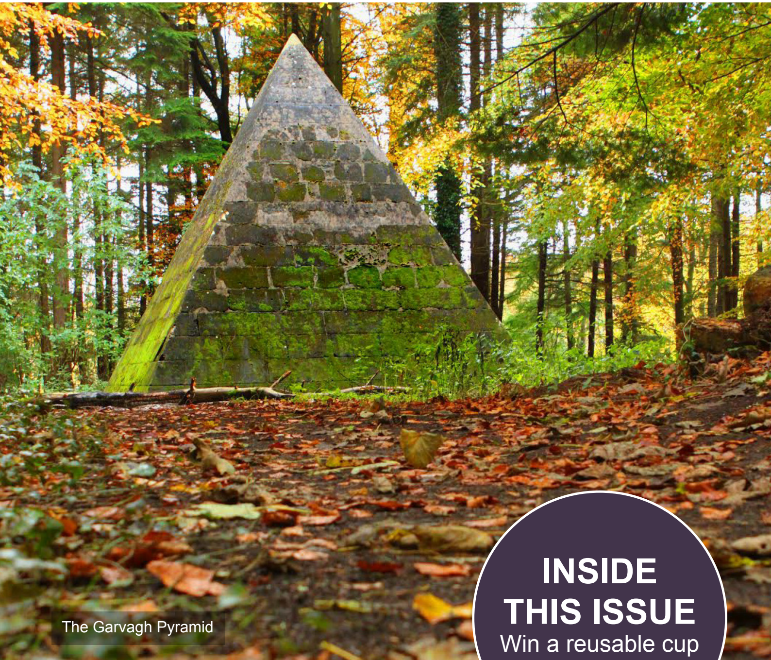
The Garvagh Pyramid

INSIDE THIS ISSUE Win a reusable cup Page 6