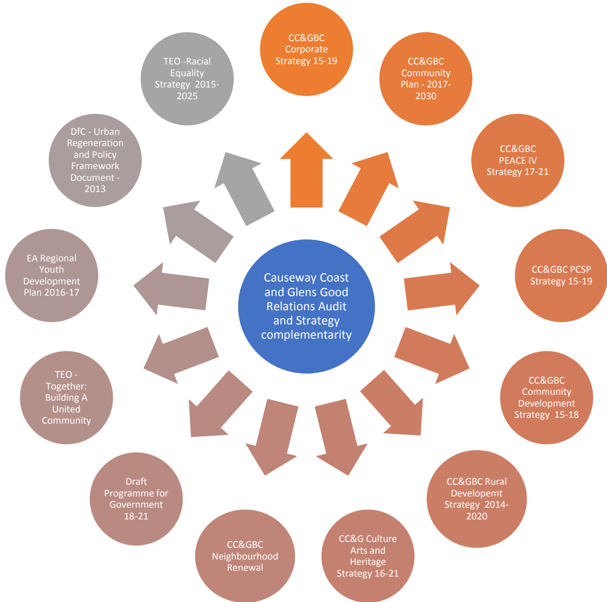
Figure 12: Causeway Coast and Glens Good Relations Audit and Strategy Strategic Context

A number of key strategic documents have been reviewed, the priorities of which have been taken into account in the development of this audit and strategy.