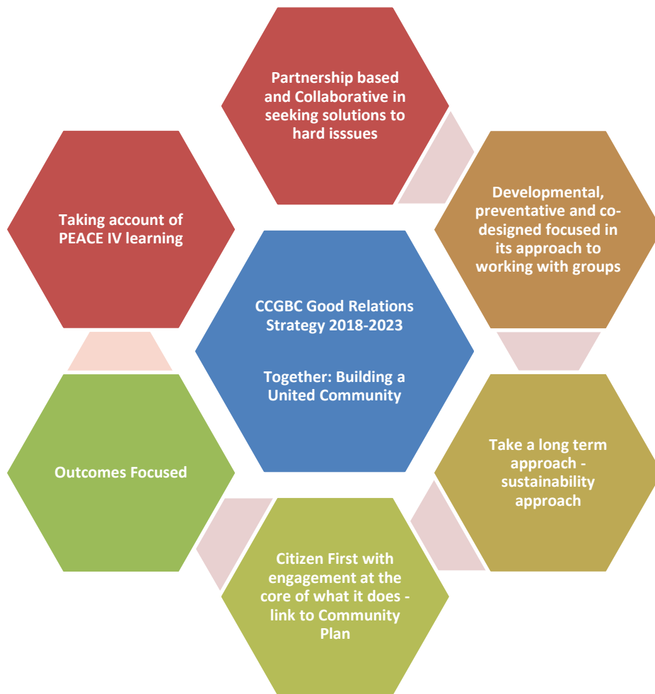
Figure 13: Values of the Causeway Coast and Glens Good Relations Strategy moving forward