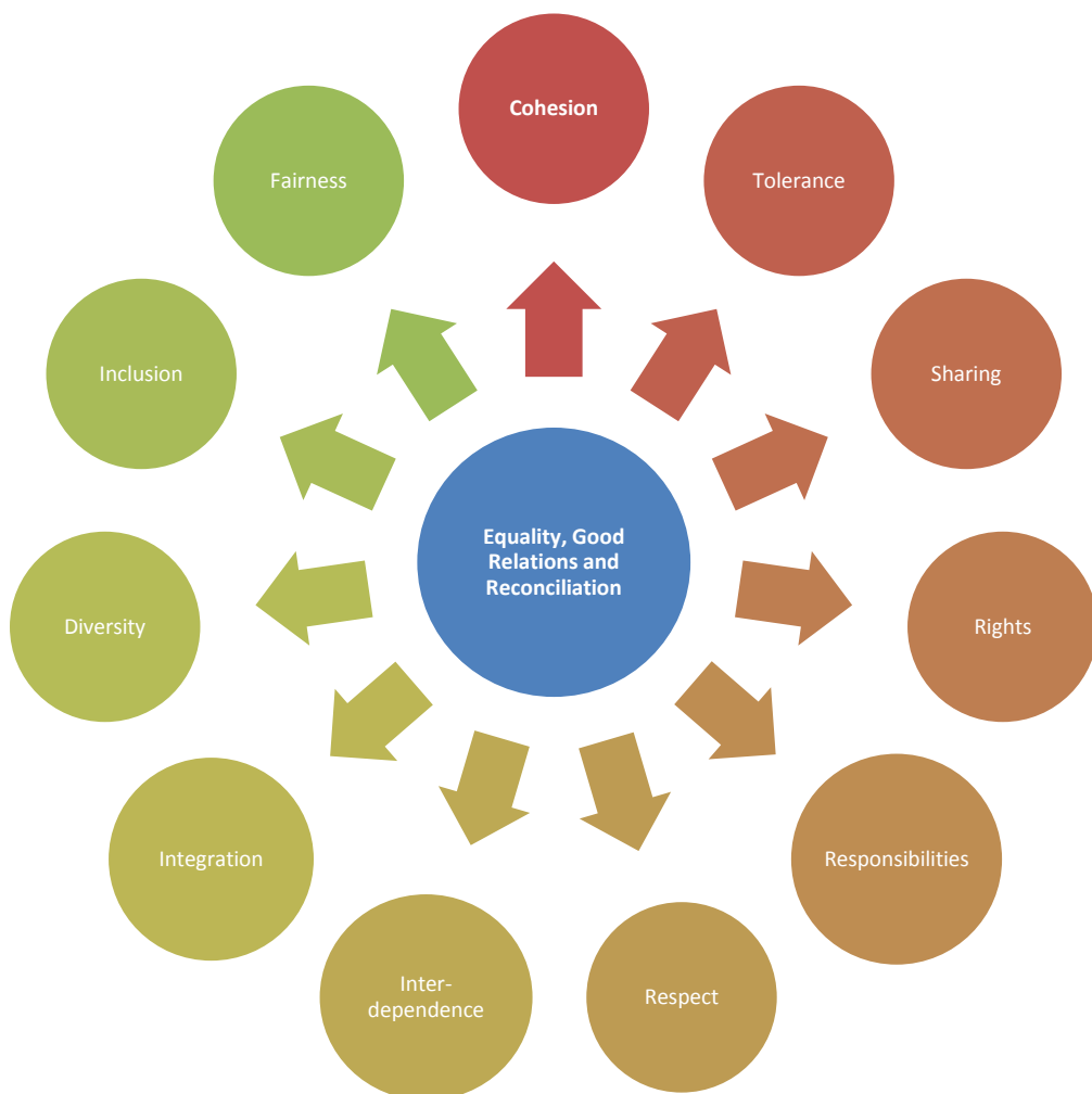
Figure 10: TBUC Underpinning Principles Chart

It is important that there are closer linkages between political activity and the work going on at a local level. The Executive Office believes that the underpinning principles of its Strategy, outlined below, provide a set of shared values that will link political leadership with individual and community effort and motivation.