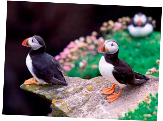
Rathlin has Northern Ireland's largest seabird colony