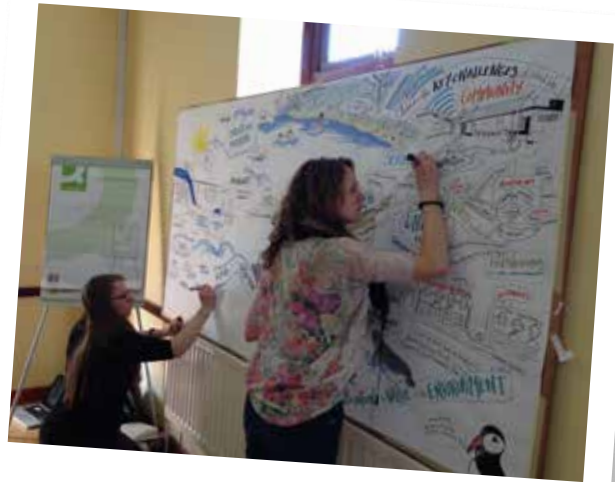
The 'More than Minutes' Team working on the visual minutes

To enhance connections on-island, between the island and the rest of Northern Ireland; with other communities, island communities and similar interest groups.