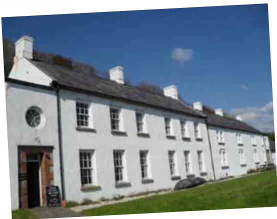
The Manor House Guesthouse & Restaurant

The development and promotion of the Rathlin tourism and environmental products has and will continue to be the key to the growth of the island economy. The island's creative industries and its natural capital are prime tourist draws. Increased involvement in and development of social enterprise will also impact positively on the island economy.