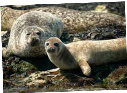
A young Rathlin Grey Seal with its mother

Rathlin's range of environmental designations and its relative remoteness are also unique selling points. Environmental preservation must be balanced against the needs of a living, working community. Ongoing support and collaboration will be essential elements in building on the islanders' commitment to their role as environmental custodians.