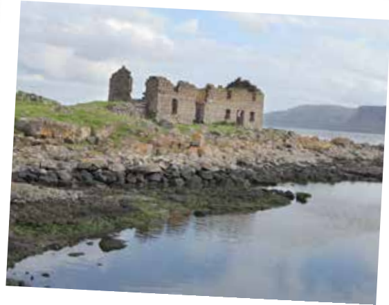
An example of Rathlin's built heritage