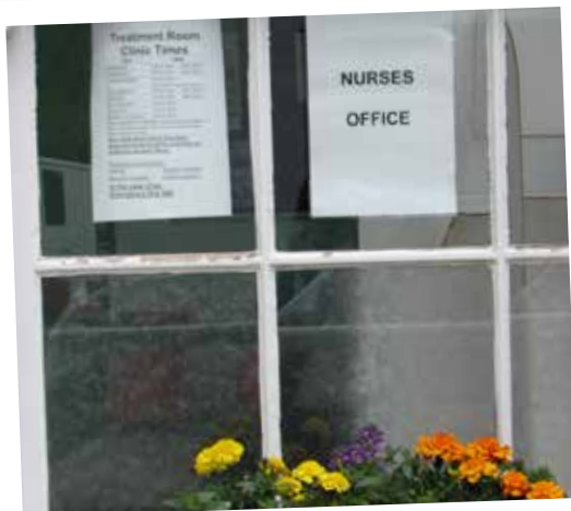
Finding appropriate ways to deliver essential services

Providers need to seek innovative ways of delivering services to meet the needs of the island community. A one size fits all approach is not appropriate. Advances in technology present a unique opportunity to reconsider how services can be delivered innovatively, particularly in respect of health and veterinary care.