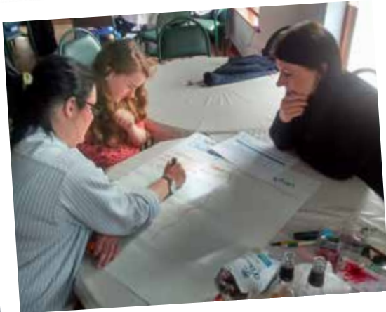
Islanders working on the Community Action Plan

The key theme of Island Linkages has been updated in the Revised Action Plan and will now be referred to as Island Connections. This change reflects the need to make this development area about more than infrastructure provision and to promote the development of both “hard” and “soft” links not only internally on Rathlin itself but also externally to Ballycastle, across the North of Ireland and with other island communities and similar interest groups.