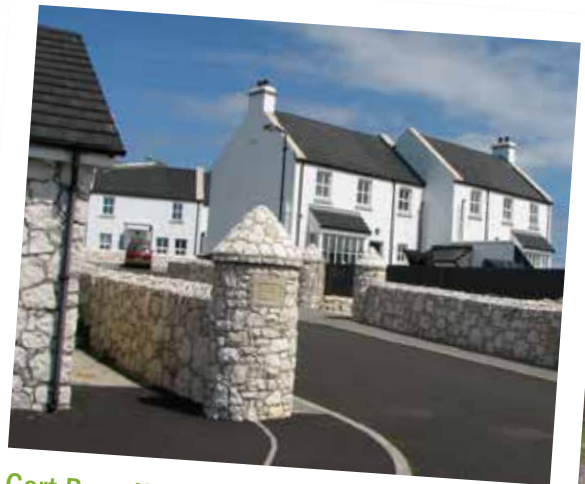
Gort Beag Housing Scheme

The Gort Beag housing scheme was a significant development during the period of the last Action Plan. The development provided new homes for existing Rathlin residents, offering greater security to young families wishing to remain on the island and also allowed Rathlin to welcome some new residents.