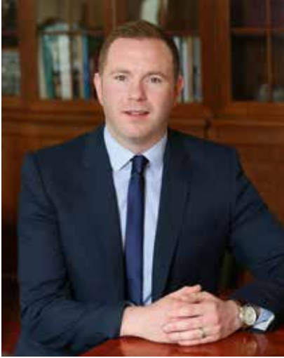
Chris Hazzard, Minister of the Department for Infrastructure

Nam untia volor re velignimus ex erro berum restem am reicipsamus, eumquib ernatis et velissedit litaque veles nus, es volor si cora quat et harchic aboremo loreprorum et id magnis sunt ium rendis ad quia conesequi reped quis auta sin consed quiam qui qui ide nimet eum adigenitas assint por solorrum fugiam.