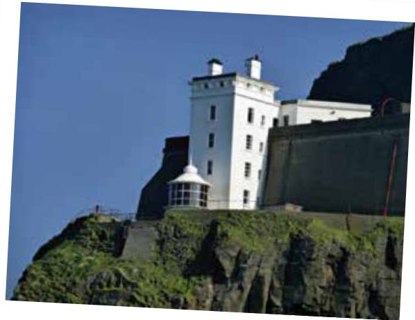
West Light visitor Centre, one of the Great Lighthouses of Ireland