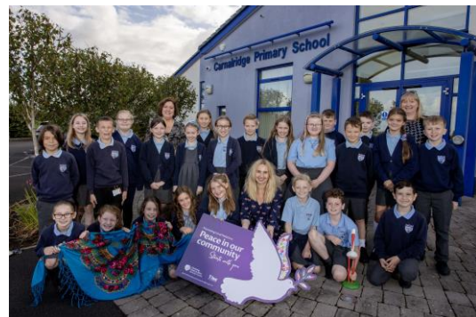
Pupils from Carnalridge Primary School (Portrush) pictured at one of the Exploring Cultural Diversity workshops which focused on Poland.