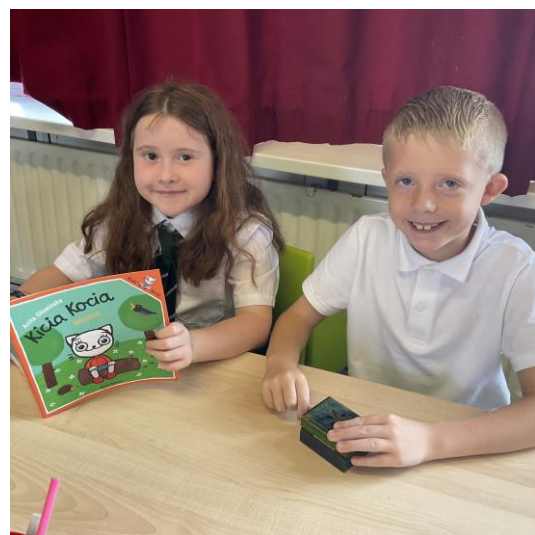
Pupils from St John's Primary School (Coleraine) pictured at one of the Exploring Cultural Diversity workshops which focused on Poland.