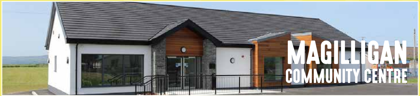
MAGILLIGAN COMMUNITY CENTRE