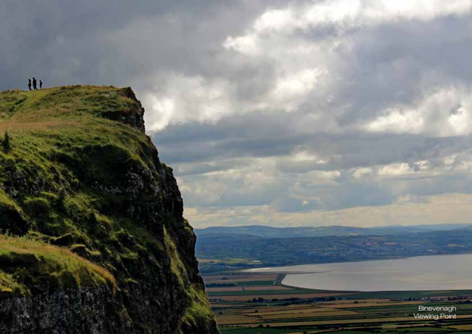
Binevenagh Viewing Point