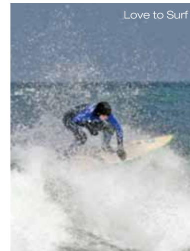
Love to Surf

Welcome to Causeway Coast and Glens Borough Council's Council Strategy 2015 - 2019