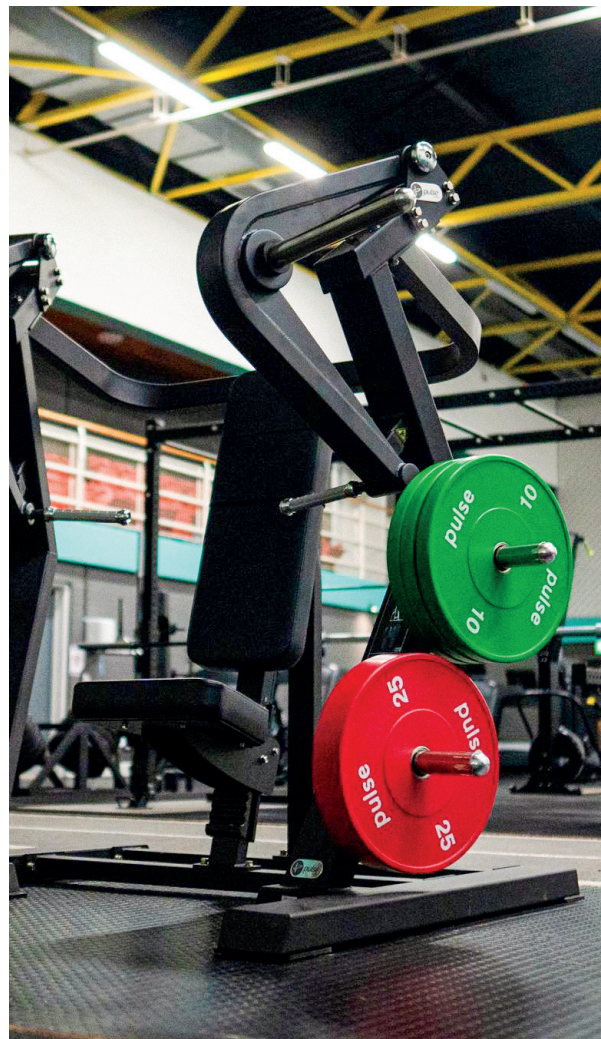
Roe Valley Leisure Centre