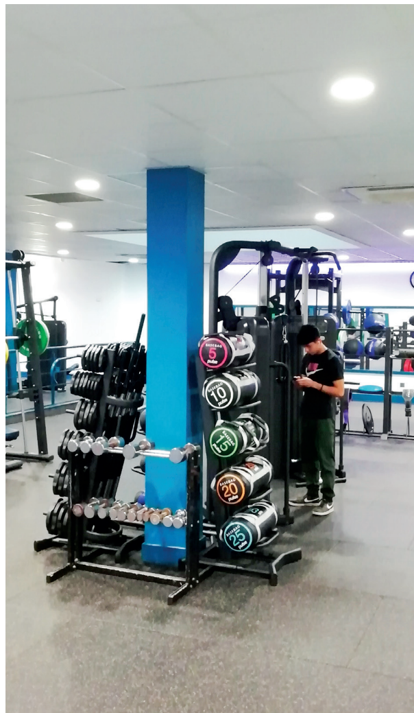
Coleraine Leisure Centre