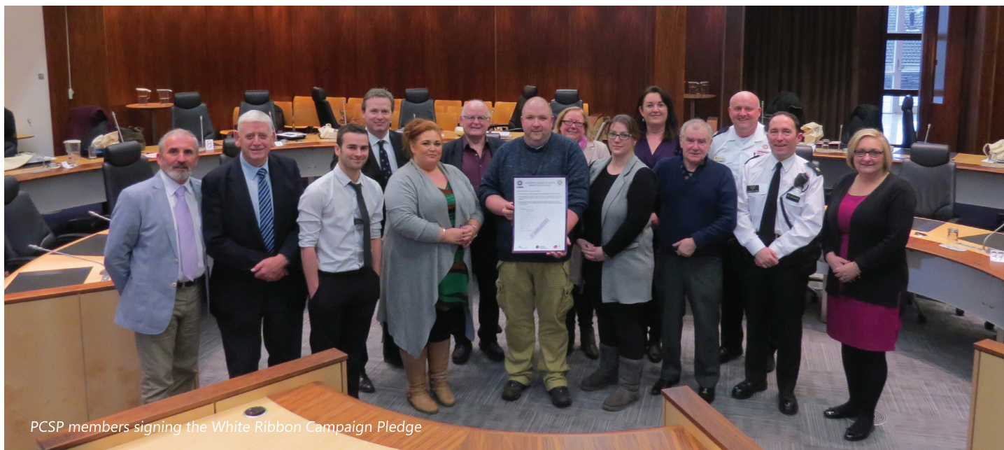
PCSP members signing the White Ribbon Campaign Pledge