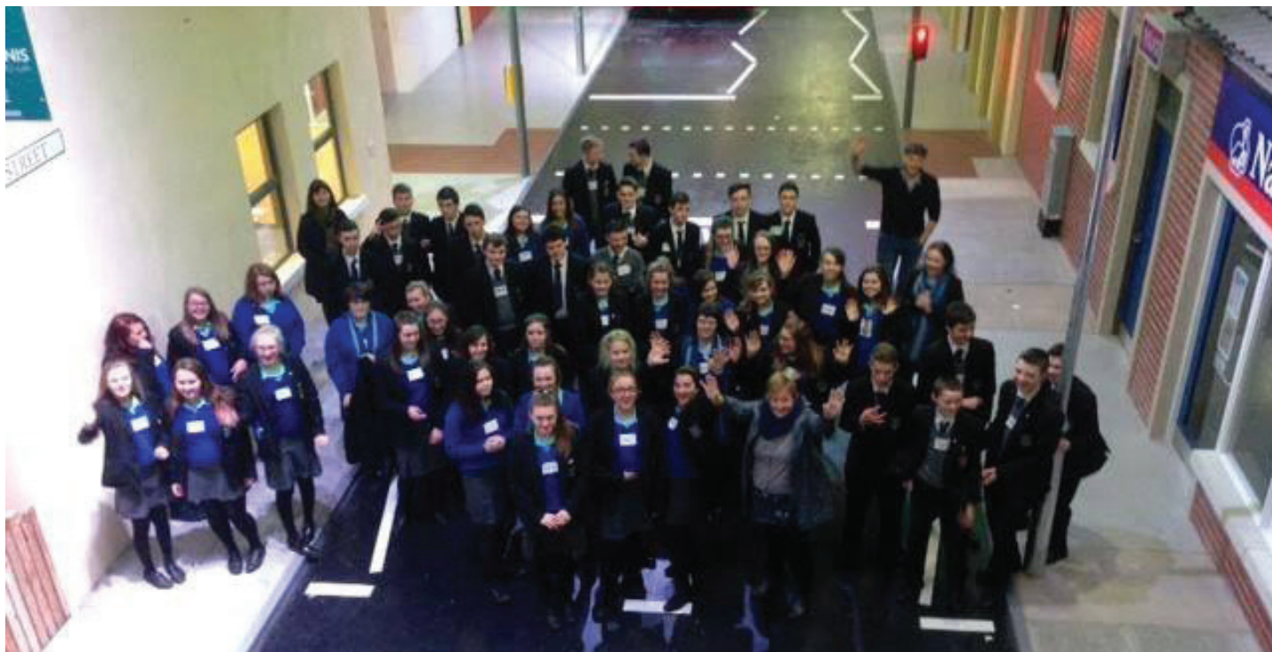
Pictured are pupils from Ballycastle High School who attended RADAR on Friday 15th January 2016.