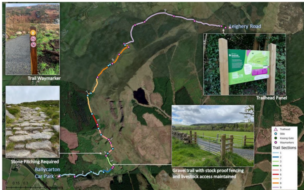
Fig. 4: Trail Works Map