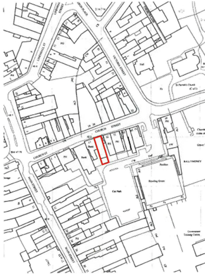
Site Location Map Scale 1:1250