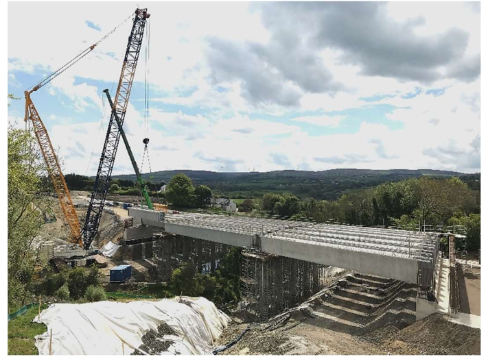
Beams being lifted in place for the Liberty Glen bridge.

Further information on the works and traffic management is available on the scheme website at: <u>https://a6d2d.com/</u>