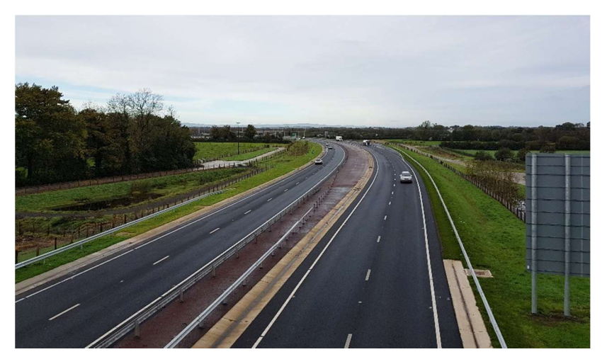
Looking west from Aughrim overbridge