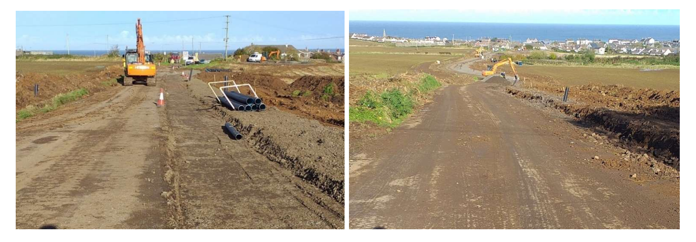
Freehall Road, Castlerock – Scheme in Progress

Work is progressing well to extend the existing footway from the housing development on Freehall Road to Mussenden Road. The existing verges are be lowered and widened at the bends on the road, which will result in improved forward visibility for drivers and safety for pedestrians. This proposal will link existing footways along this popular walking route, further encouraging active travel.