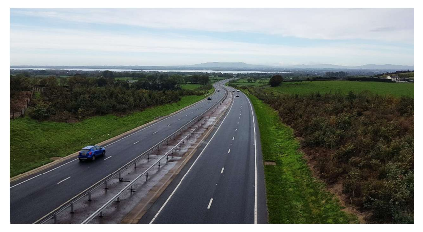
Looking west from Ballynafey Road bridge

The Infrastructure Minister Nichola Mallon visited the site on 28 May 2021 to speak to those involved in the delivery of this major infrastructure project.