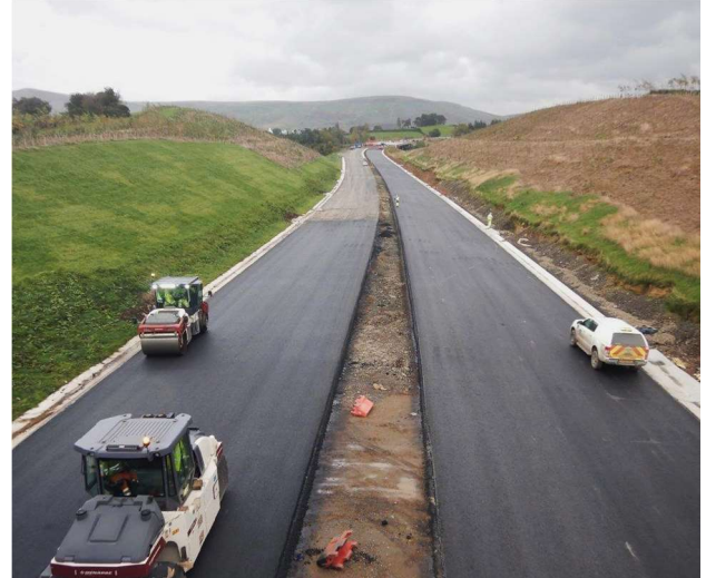
Construction of dual carriageway at Magheramore.