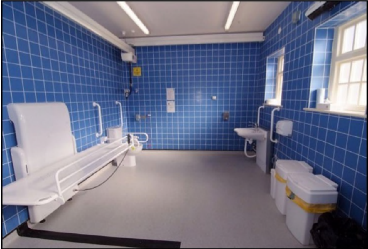
Example of a Changing Places Toilet facility.