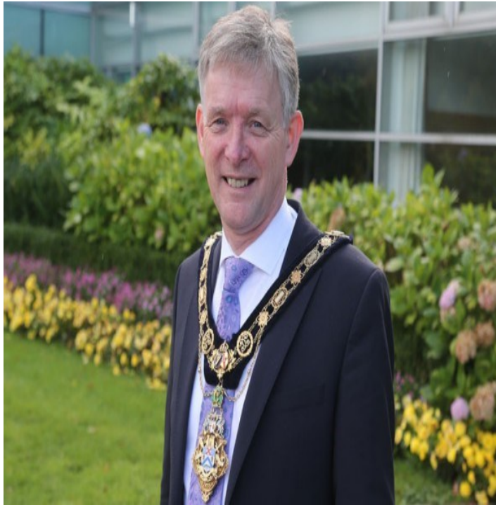
Alderman Mark Fielding

Mayor of Causeway Coast and Glens Borough Council