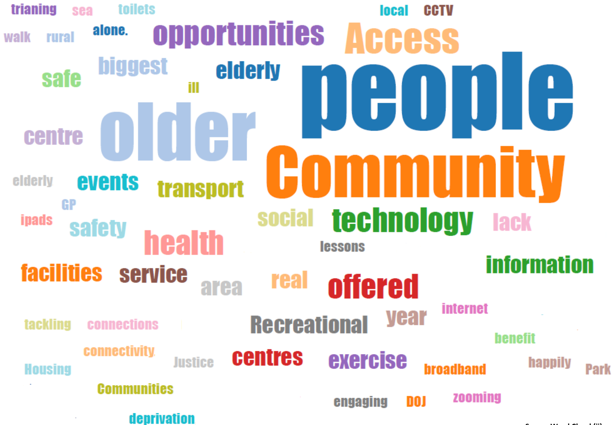
Survey Word Cloud (ii)