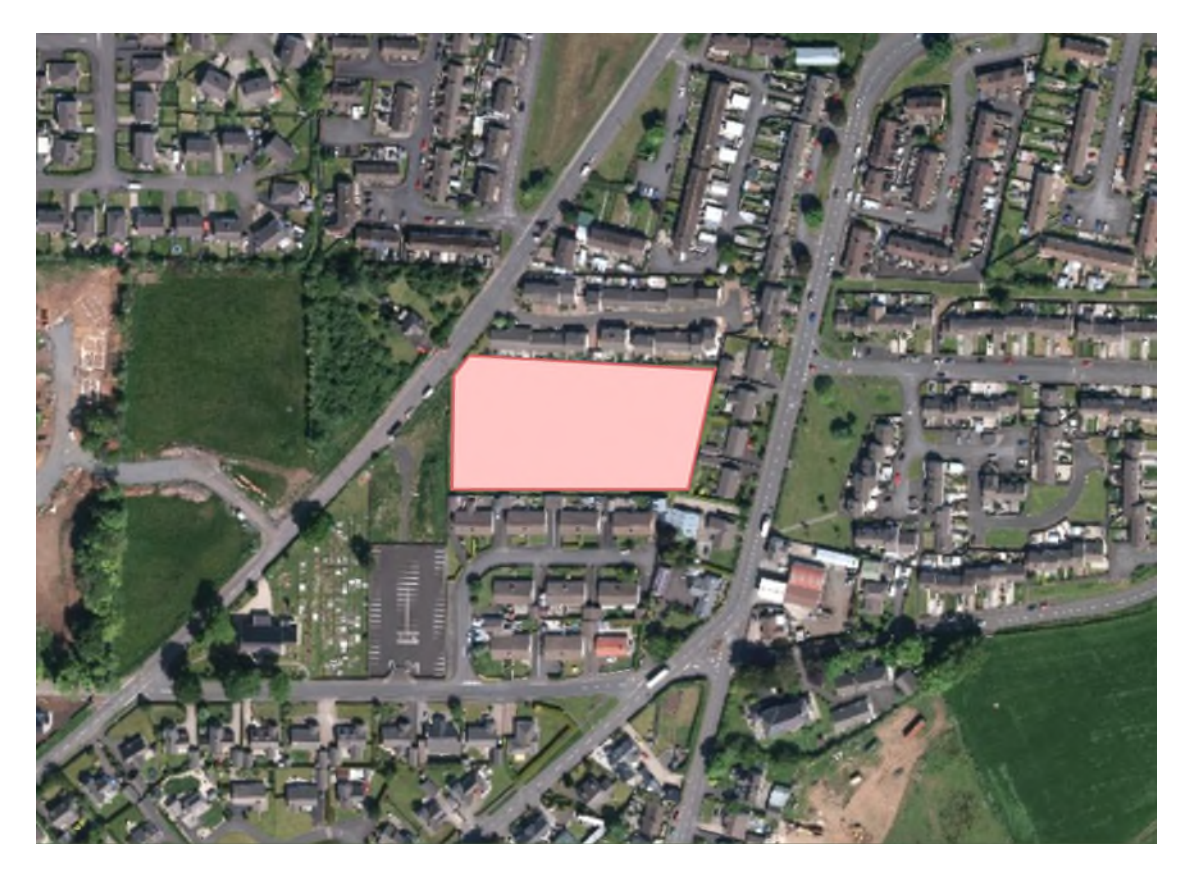
Plan 5 Ramoan Road, Ballycastle