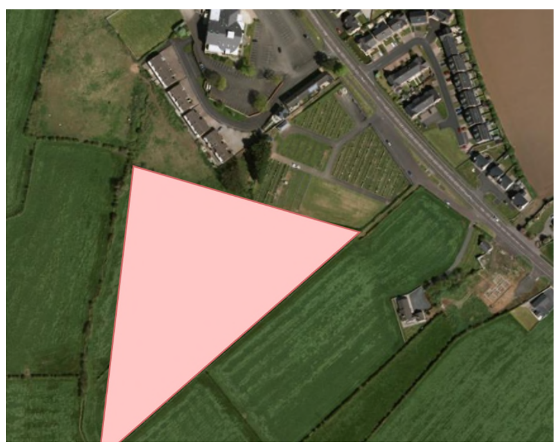
Plan 4 Coleraine Road, Portstewart