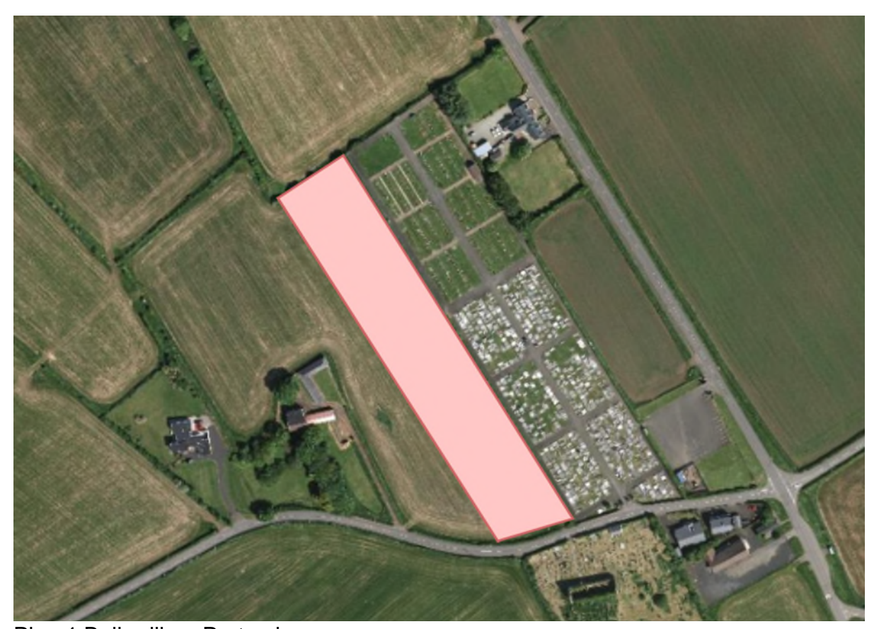
Plan 1 Ballywillan, Portrush

It is recommended that the Environmental Services Committee recommends to Council that the Land & Property department explores the options to purchase land adjacent to the existing Coleraine and Ballymoney sites for future cemetery development subject to planning approval. Further report to then be brought back to committee.