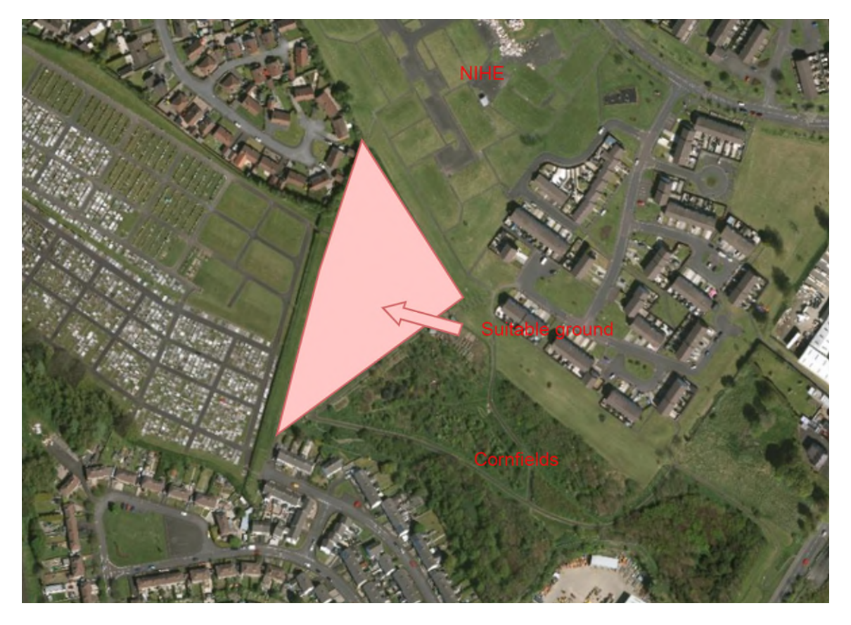
Plan 3 Coleraine