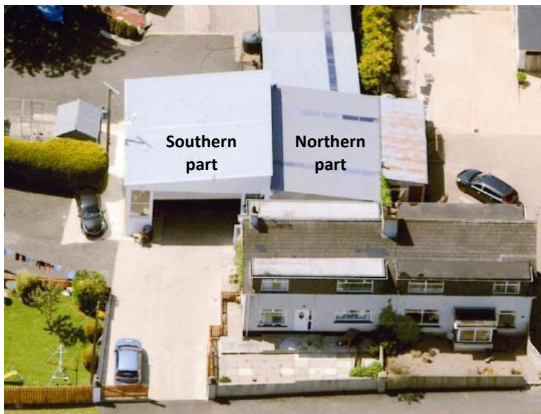
Photo 1: Aerial photograph of site (date on rear of photo is 9 th June 2012)