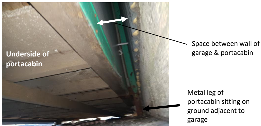
Photo 6: View of underside of portacabin which shows spacing between it and the garage