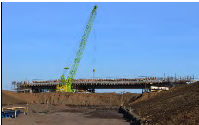
Construction of Derrygowan bridge

Drone footage of progress is available on https://www.youtube.com/channel/UC7qq4Hmth9zxz3gTxA4D2RQ . Visit https://www.infrastructure-ni.gov.uk/topics/road-improvements/a6-randalstown-castledawson-dualling-scheme to find out more about the scheme.