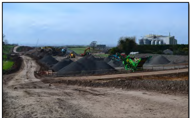
Local material processing site east of Ballynafey Road