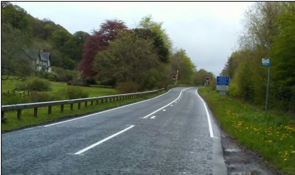
A2 Seacoast Road Downhill approaching Umbra Level Crossing